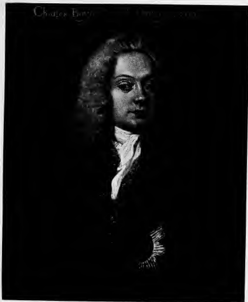
Charles 4 th Earl of Orrery, K.T.