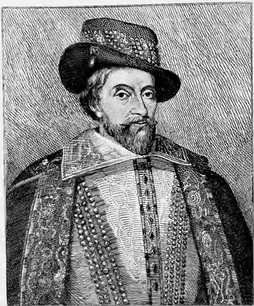
RICHARD BOYLE, FIRST EARL of CORK LORD HIGH TREASURER of IRELAND &c. &c.