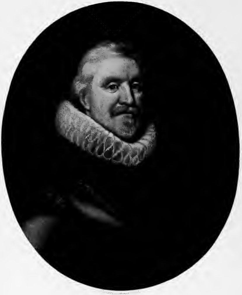
Roger Boyle, 2 nd Earl of Orrery (grandson of Richard, 1 st Earl of Cork.)