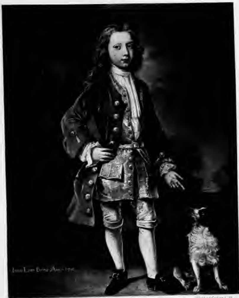
John Lord Boyle 5 th Earl of Cork and Kerry.